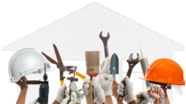
BUILDING & EQUIPMENT MAINTENANCE