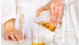
QUALITY CONTROL & QUALITY ASSURANCE