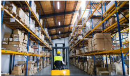
WAREHOUSE, INVENTORY & LOGISTICS