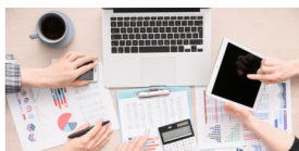
HUMAN RESOURCES & PAYROLL